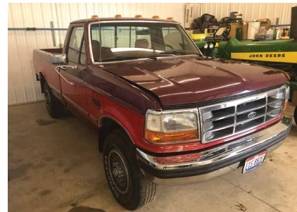
Auction By Order Of: Steve & Rita Smyers

ONLINE TERMS: Wire Transfer only accepted. 5% buyer's premium on all sales. Information is believed to be accurate but not guaranteed. Multi par auction process may be used.